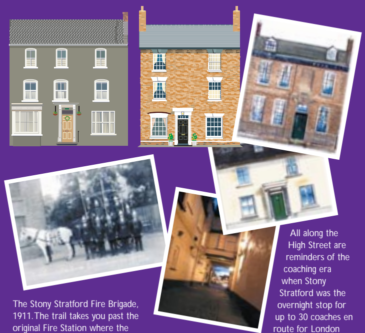
All along the High Street are reminders of the coaching era when Stony Stratford was the overnight stop for up to 30 coaches en route for London

A short stroll covering the history and development of this unique town.